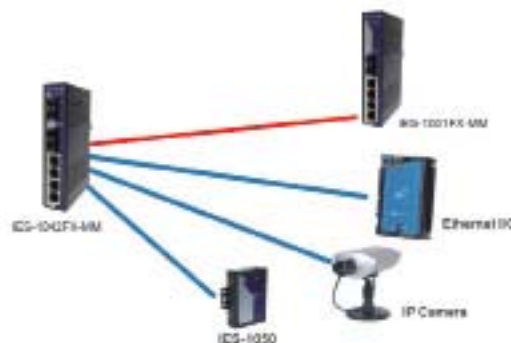
Connections of Ethernet devices

IES-1041FX/1042FX series can be used in connecting several Ethernet devices like Ethernet I/O, IP-Camera or other Ethernet switches. In addition, there are two different power inputs at terminal block to avoid interruption caused by power down. When the primary DC power input fails, the backup power input will take over immediately to guarantee a non-stop operation.