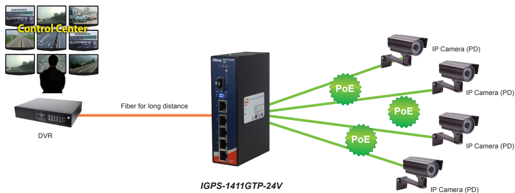
Connections of Ethernet devices

IGPS-1411GTP-24V can be used in connecting several PoE P.D. Ethernet devices like IP-Camera or other Ethernet devices. In addition, there are two different power inputs at terminal block to avoid interruption caused by power down. When the primary DC power input fails, the backup power input will take over immediately to guarantee a non-stop operation.